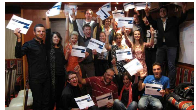
Participants of the Digital YIntro Training to Trainers with their certificates

To provide permanent and sufficient supply of trainers for all the training courses the Training Task Force have developed, ERYICA organized 3 training to trainers courses on a project basis during 2013.