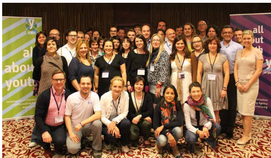
Participants of the 24th General Assembly

The 24th General Assembly (GA) of ERYICA was hosted by the ERYICA Affiliated Organisation GSM Youth. During the Assembly, a new President and Governing Board were elected with a mandate until the GA in 2016.