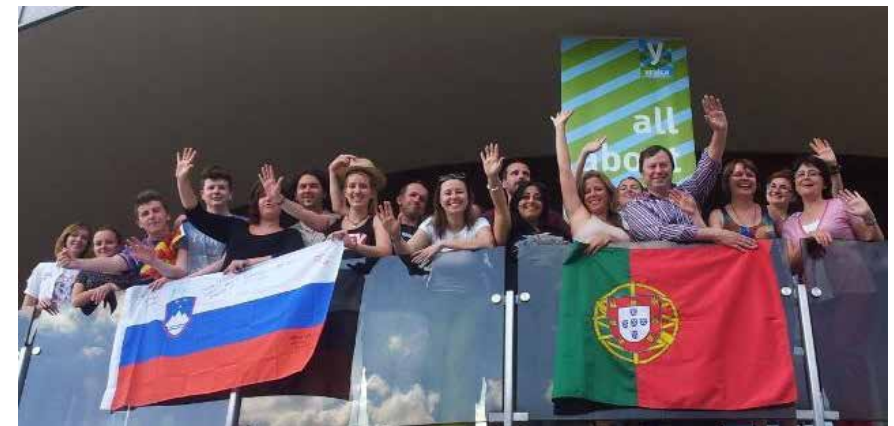
Participants of the 1st Networking Meeting in Maribor, Slovenia

The service is planned to become a permanent offer of Youth Information Centres that belong to the ERYICA network and as a first step towards this, YoMIM Centres will be mapped on the European Youth Portal.